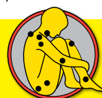
Table 1 (citation to reference 1)